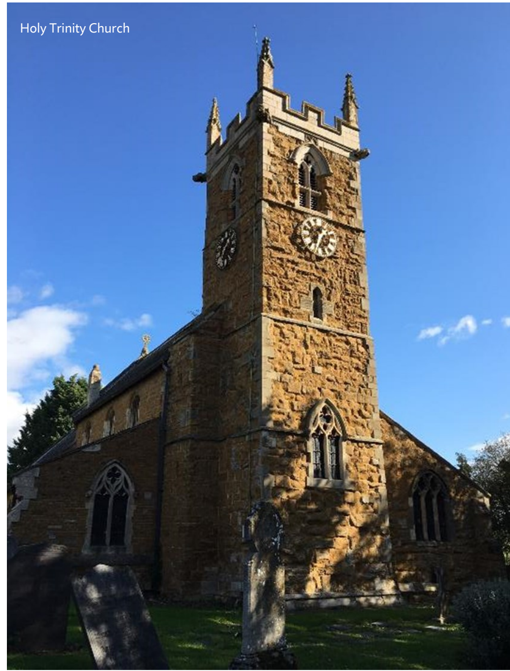
Holy Trinity Church