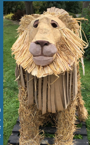
The annual village fun run and Autumn fayre with a scarecrow competition. Two of the village events which raise funds for the school, organised by the PTFA.